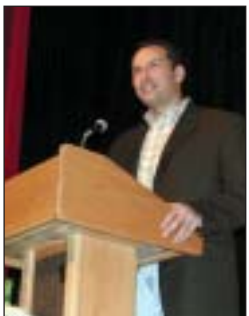
San Antonio Mayor Ed Garza shows support and offers words of encouragement during the conference.